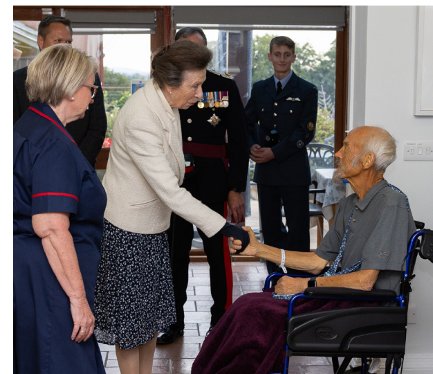
ABOVE: Her Royal Highness visiting the Day Patient unit